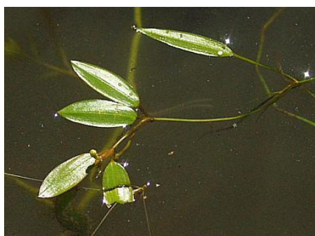
Fig. 3. Potamogeton cristatus .