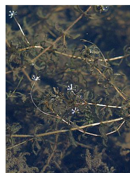
Fig. 5. Hydrilla verticillata .