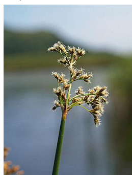
Fig. 12. Schoenoplectus validus