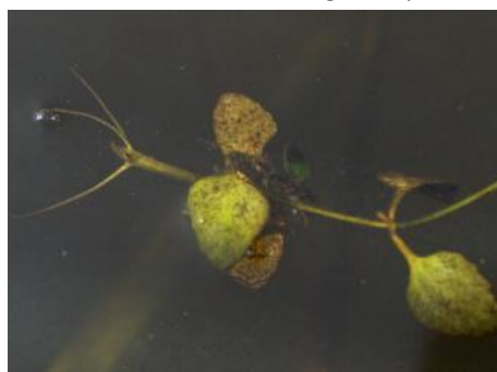
Fig. 11. Trapella sinensis .