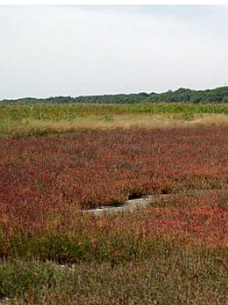
Fig. 6. Salicornia europaea .