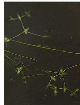
Fig. 10. Lemna trisulca .