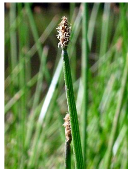
Fig. 8. Eleocharis mamillata