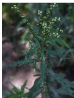
Fig. 13. Monochoria korsakowii .

*Institute of Marine Biology, Russian academy of science, Vladivostok, Russia