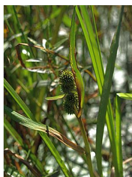
Fig. 4. Sparganium glomeratum .