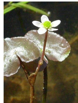
Fig. 9. Thacla natans .