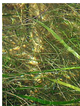
Fig. 2. Zostera marina / Z. nana .